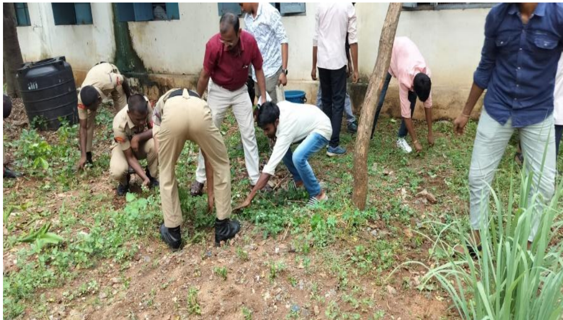
Weeding by NCC students