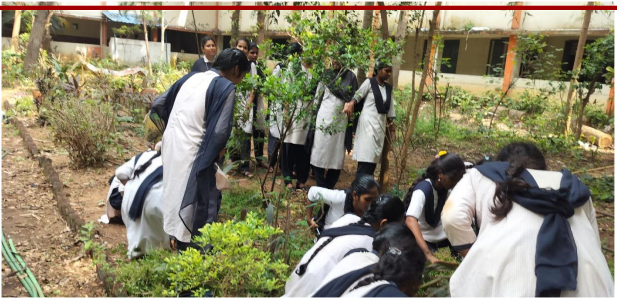
BA students participated in the beautification of rock garden